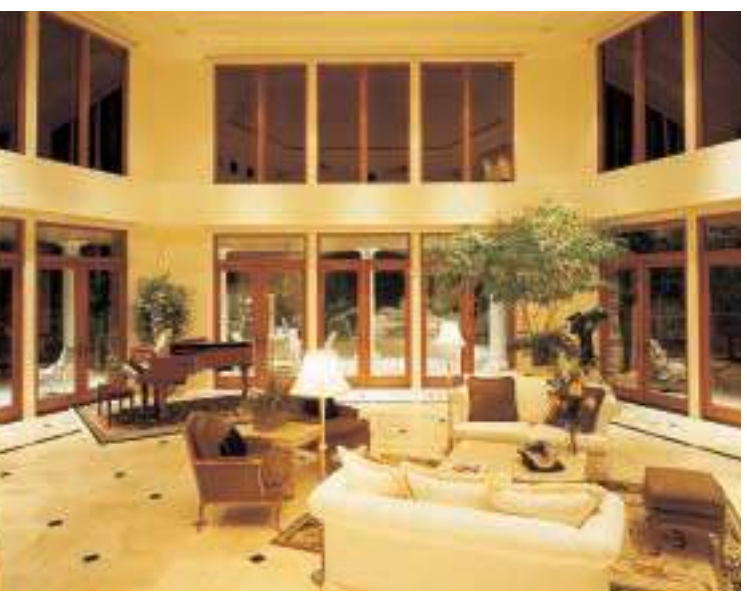
When you're on the inside looking out, the 3M Night Vision window film's low reflectivity allows ultra-clear views—even at night.

According to Kehl, Night Vision window film made sense for several reasons.