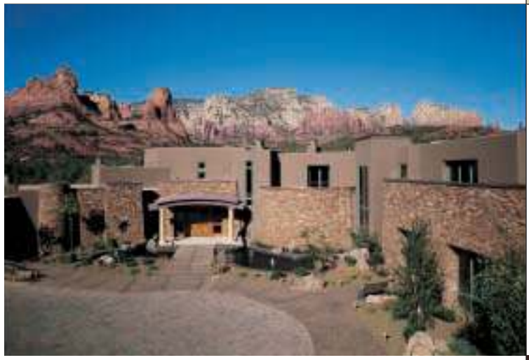
This Sedona, Arizona, home was designed with numerous windows to invite the splendid red rock mountain views on every side.